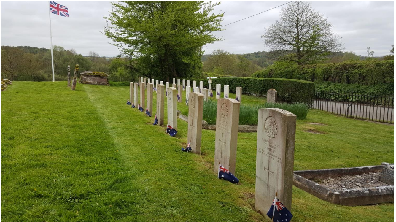
St. Edith's Churchyard, Baverstock